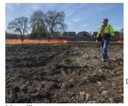
Headlines Altamira Breaks Ground in Sonoma [4]